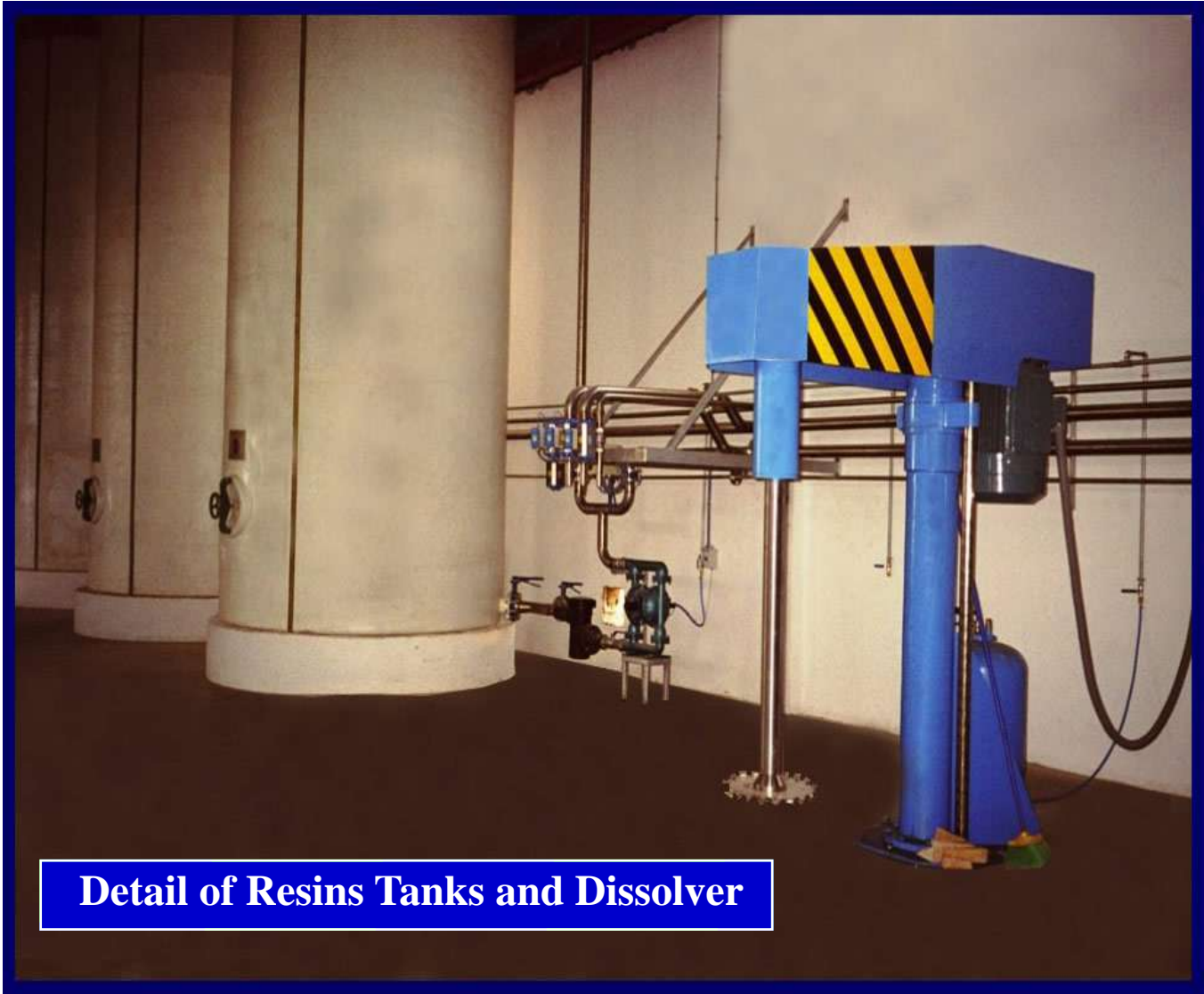
Detail of Resins Tanks and Dissolver