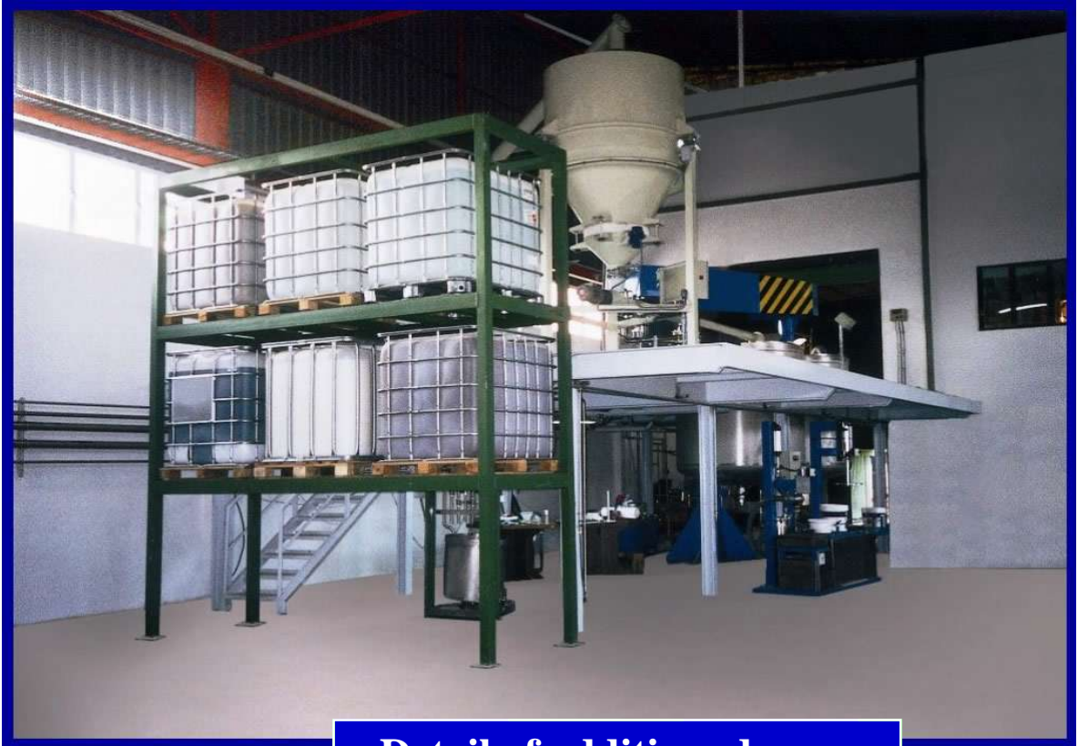
Detail of additives dosage