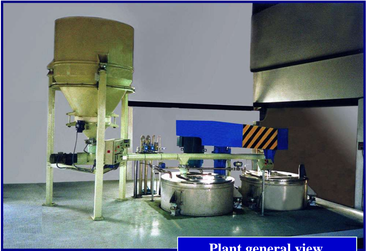
Plant general view